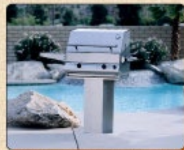
IN-GROUND PERMANENT POST

5 inch x 6 inch Stainless steel post, stainless steel side shelves.