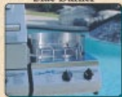
LP P/N 10577 NG P/N 10576