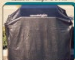
EC30 B/I P/N 10573 EC24 B/I P/N 10749 EC30 CARTP/N 10748 EC24 CARTP/N 10754