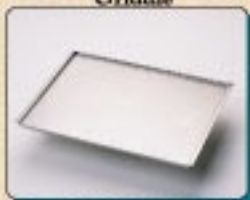
EC 30 P/N 10796 EC24 P/N 10795