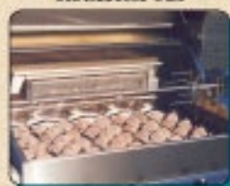
EC30 B/I P/N 10568 EC24 B/I P/N 10658