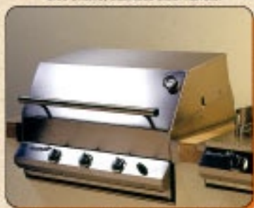
BUILT-IN PREMIER ONLY SERIES

Stainless construction, stainless steel side shelves.